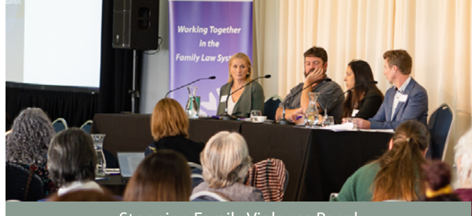
Stopping Family Violence Panel