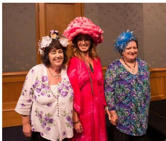
International Women's Day Sparkling High Tea attendees taking part in the Hat Wearing Competition

The meeting concluded after two hours of worthwhile conversation in good spirits over some healthy snacks and drinks. Everyone was thanked for their presence and contributions.